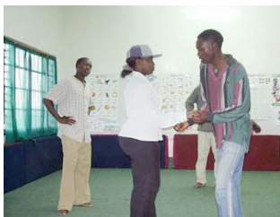
Drama club members practice for their latest performance