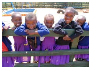
ELC Students pose outside near the playground before the celebration