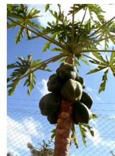
A papaya tree flourishes in the educational garden

Ideas are blooming everywhere as this year's plans for the educational garden take root. The CERC garden committee hopes to continue to expand the utility of the garden by extending the tradition of sowing a mixture of experimental crops and local favorites. The experimental crops provide opportunities for members and staff to learn about new plant varieties, while local favorites provide a consistent yield and a solid base for financial sustainability.