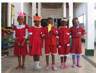
ELC Students in costume for one of the celebration's skits

On November 21 st the Early Learning Center marked the successful end of its first full year of operation with a festive celebration for students, teachers and guests. The CERC overflowed with young children, tiny shoes, and plenty of applause, as ELC students performed skits,